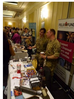
Staying safe and out of arms' reach