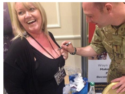
Into dangerous territory