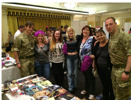
Fans with pom-poms